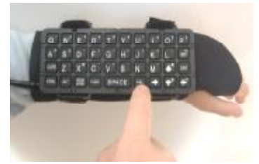
Wearable Wrist Keyboard

VisionBoard is a trademark of Chester Creek Technologies